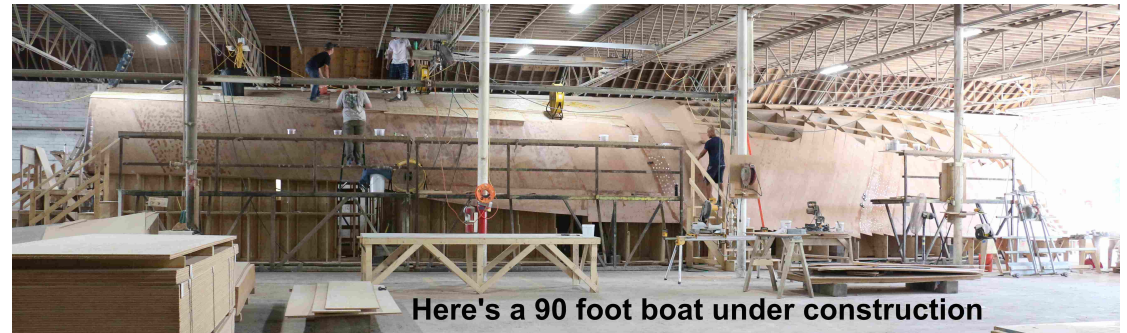
Here's a 90 foot boat under construction

For tons of information about what's going on in our own District 27, take a look at their website: District 27 of the United States Power Squadrons: http://www.uspsd27.org/