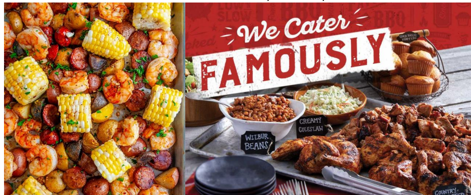
Friday Night Shrimp Boil

1277 Carolina Orchards Blvd., Fort Mill, SC 29715