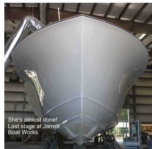
She's almost done! Last stage at Jarrett Boat Works