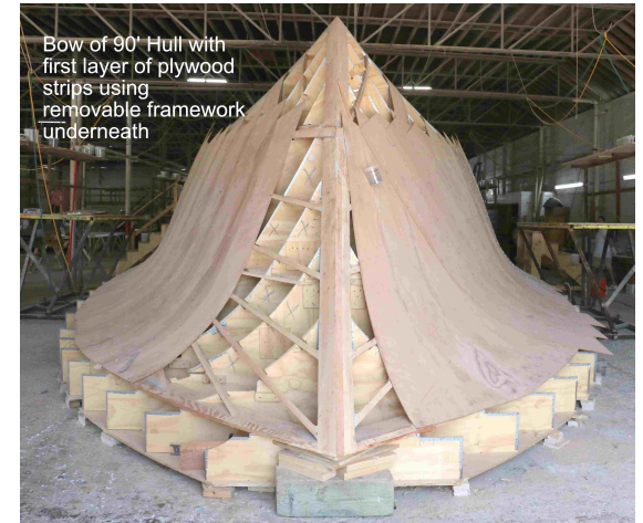
Bow of 90' Hull with first layer of plywood strips using removable framework underneath