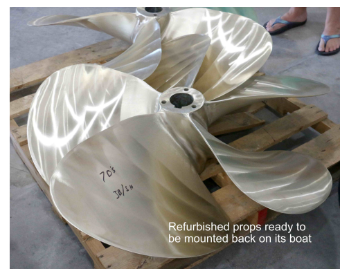
Refurbished props ready to be mounted back on its boat