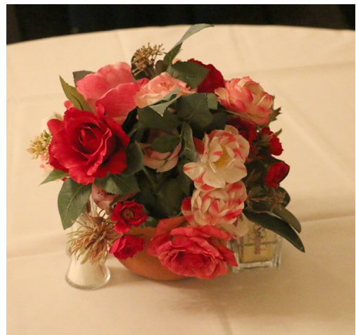
Dinner Mtg Place Settings