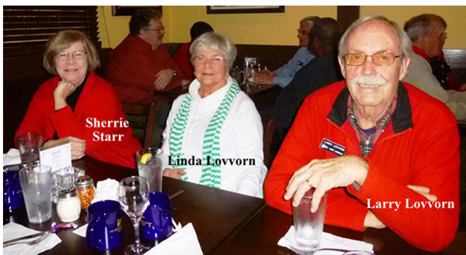
More Holiday Party Holiday Party pics by June Reasons