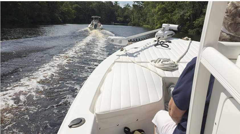
Cruising up the Trent River