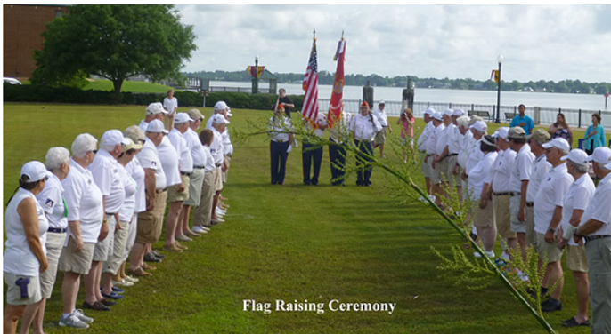
Flag Raising Ceremony