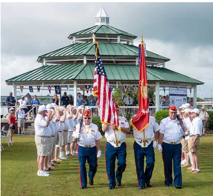
Flag Raising Ceremony