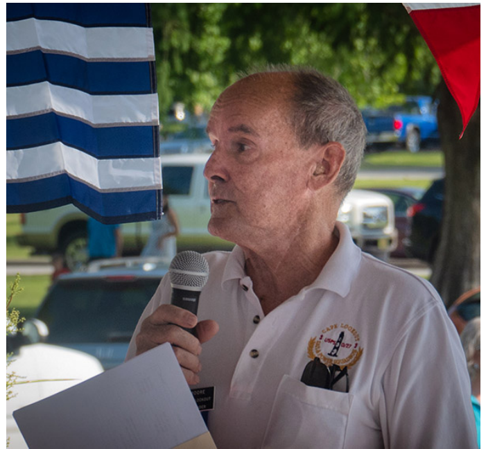
P/C Lloyd Moore