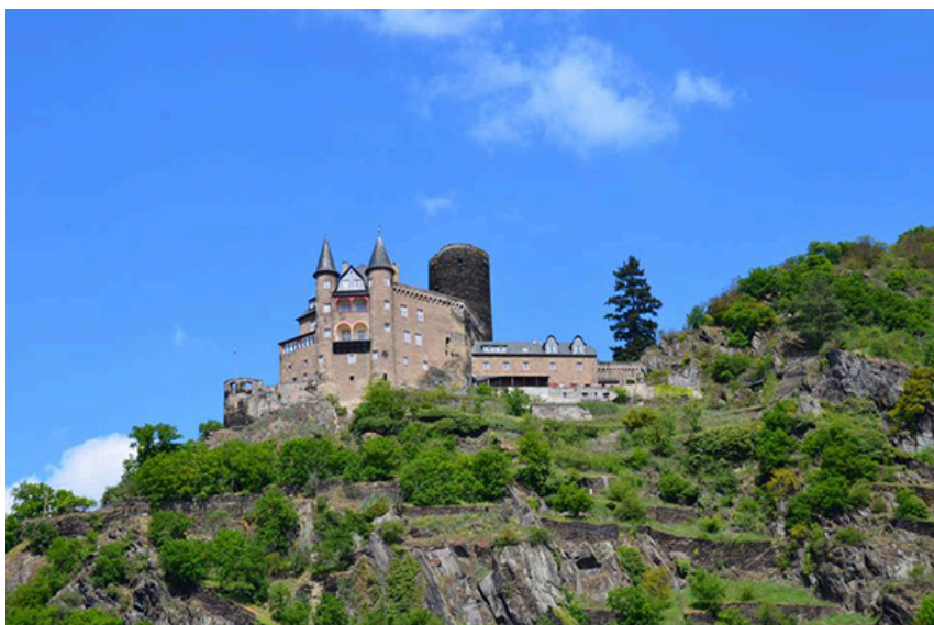
One of many castles along the Rhine

Pictures from the United States Power Squadrons River Cruise Down the Rhine (and Moselle) River April 23–May 3 2017