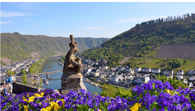
Statue overlooking the Rhine River