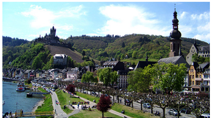
Cochem Castle on the Moselle River