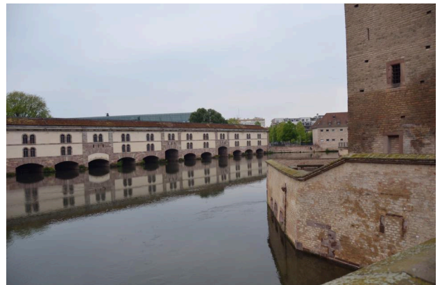
Defense Structures, Strasbourg, France

Only a small portion (about $17) of our dues to USPS is returned to the Cape Lookout Squadron. We need help keeping our books in the Black. Please contribute to the Booster Club. Any amount is helpful, but $10 per person is a suggested amount