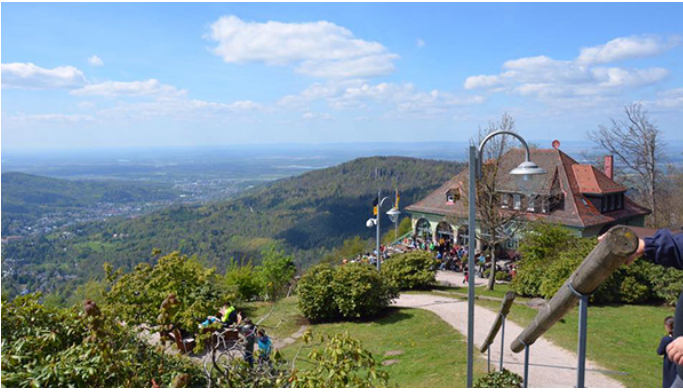
Black forest from Mount Merkur above Baden Baden