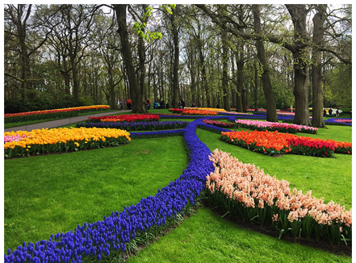
Tulips in Keukenhof Gardens near Amsterdam