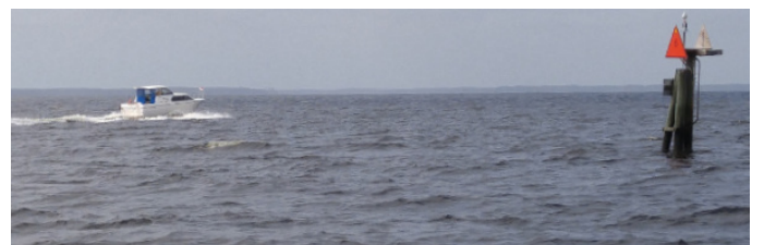
Lovvorns heading home— Red Right Returning