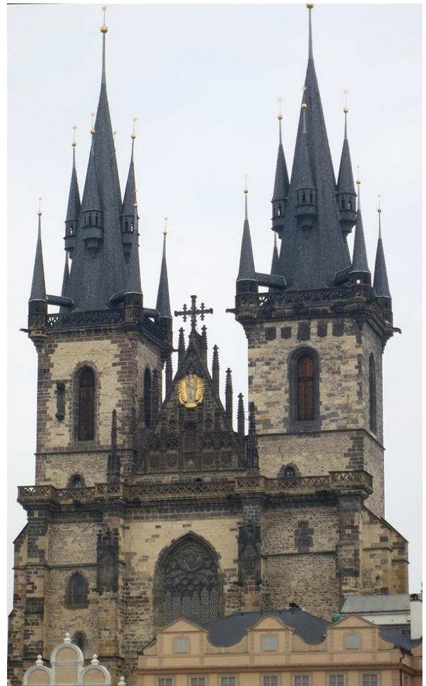
Spires everywhere! Tyn Church