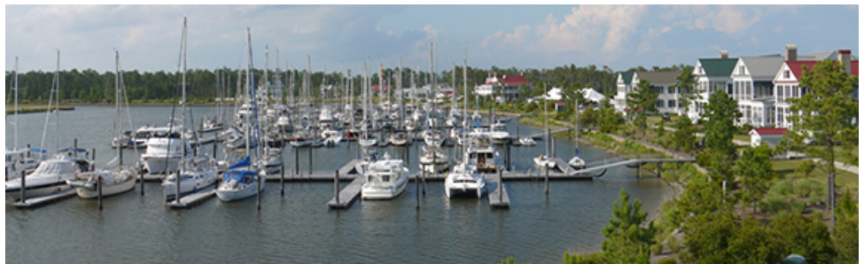
River Dunes Harbor

I look forward to seeing everyone soon."