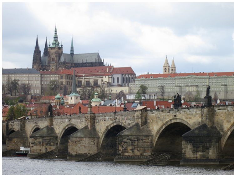
Charles Bridge with Castle in background