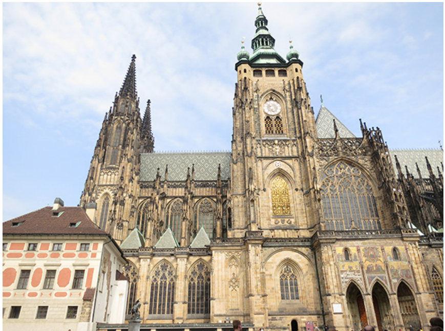
Golden Gate of St Vitus Cathedral in Prague Castle