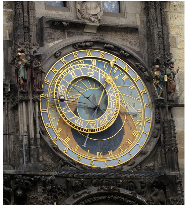
Astronomical Clock shows time, phases of moon, day/dusk/dark, Zodiac, height of sun above horizon and more.