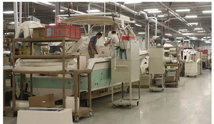
Assembly Line at Grady White

23. At What Point-In-Life Do We Become "OLD PEOPLE??" NEVER!