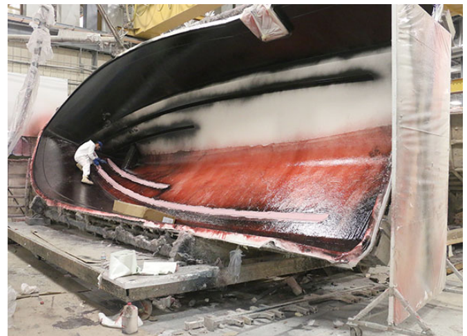
Mold for one of the larger Grady White boats