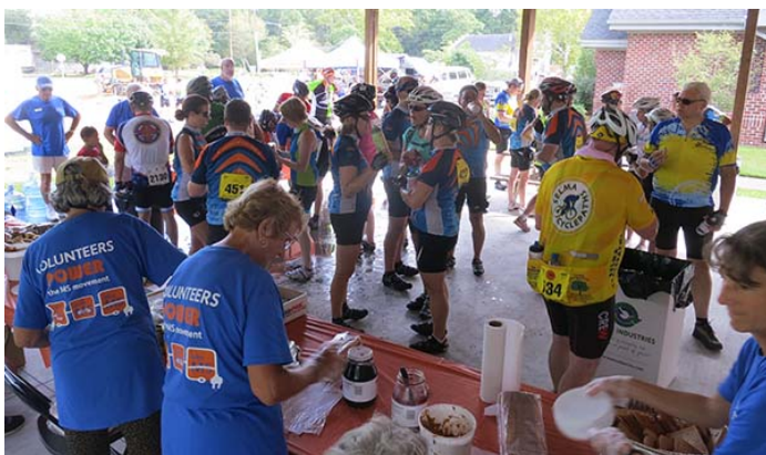
Volunteers at a Bike MS rest stop