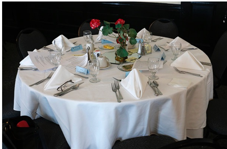
June CLSPS Dinner Meeting

Here at home, the ExCom is working to add events for the remainder of the year. We need volunteers to help organize the events. Your help can be as little as posting upcoming event to your community's billboard or taking charge of a single event. Also, there are special projects that can use your short term help. Your help, no matter how small will assist CLSPS to better serve it's members and the general public."