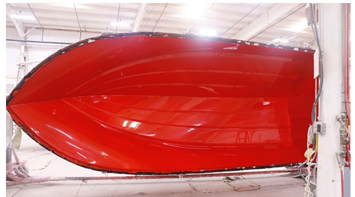
Empty mold, ready for Gel coat