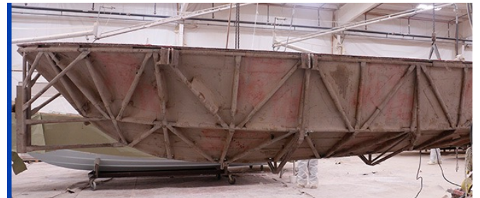
Mold with Hull inside