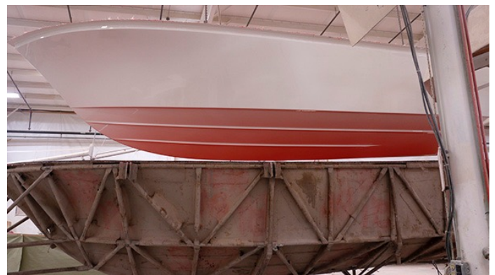
Hull is born