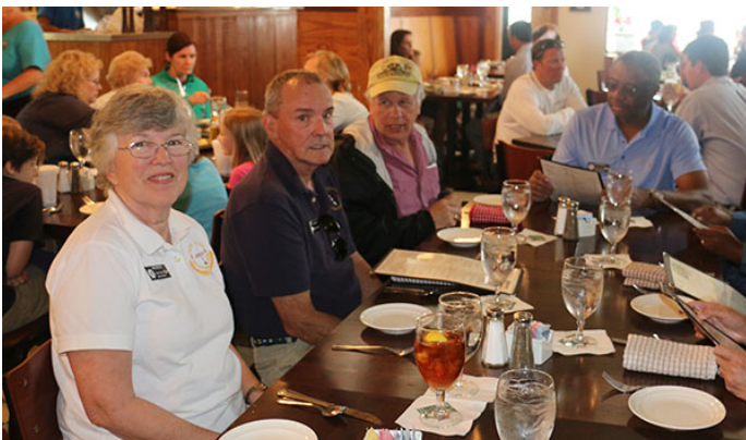
Lunch at Beaufort Grocery