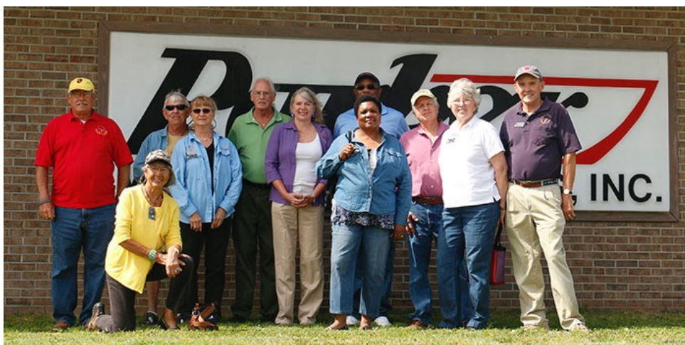
Parker Marine Enterprises Land Tour