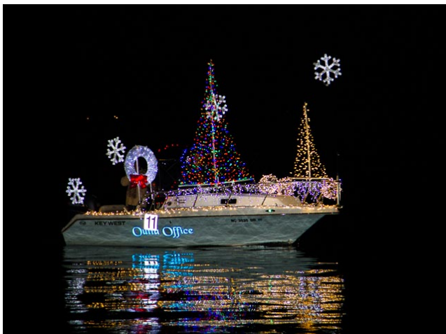
New Bern Christmas Flotilla