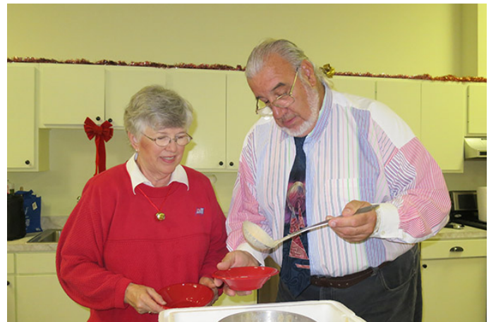
2015 Christmas Party Ed's special Chowder!

District 27 of the United States Power Squadrons: http://www.uspsd27.org/