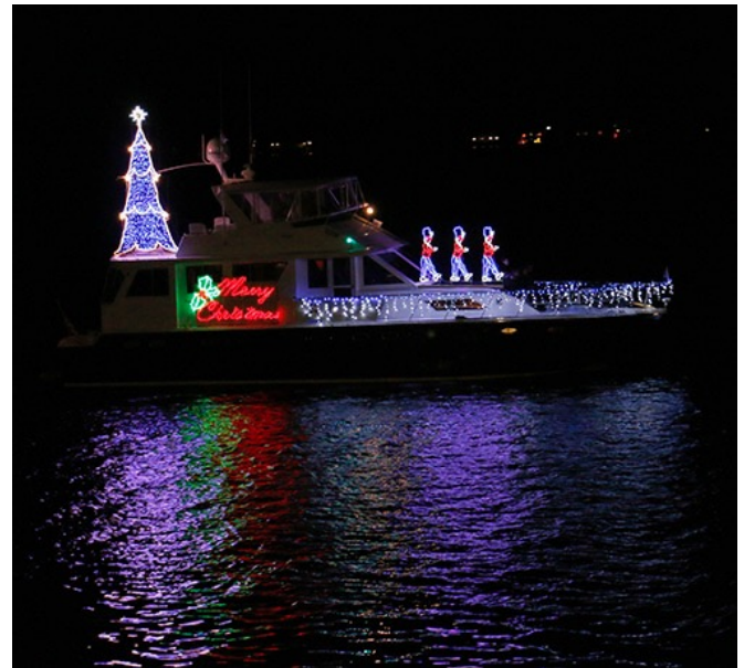
2015 New Bern Christmas Flotilla