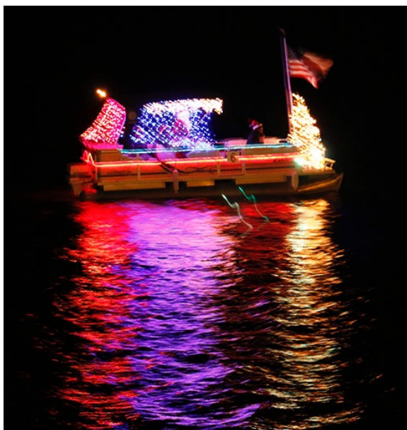
New Bern Christmas Flotilla