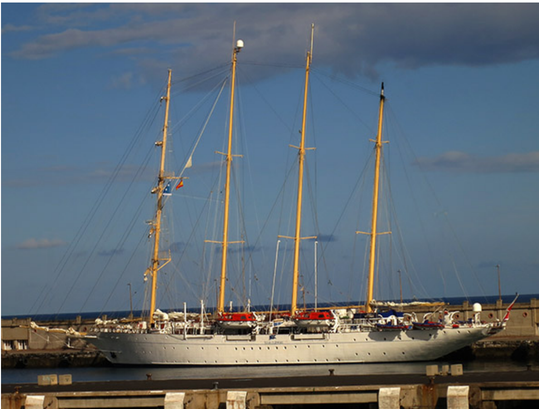
Star Flyer in Tenerife, Canaries

Number attending _____ x $23.50 each = Amount enclosed $ _____