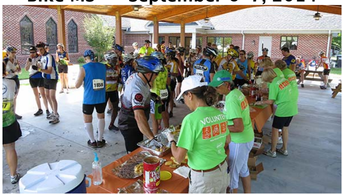
You'll have fun helping out at the Snack Stations!