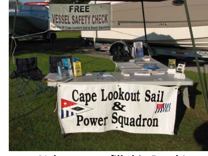
Volunteer to fill this Booth!