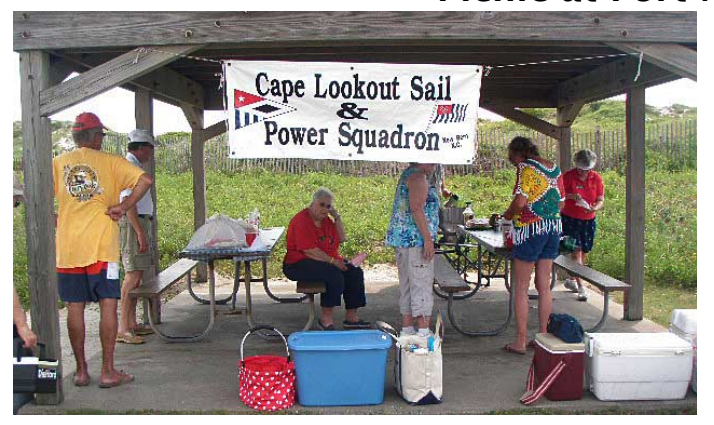
June is thinking about it!