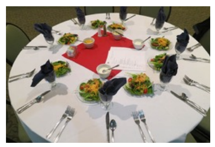
November Dinner Meeting at The Flame

Our next Dinner Meeting is the Annual Meeting in January—Please sign up!