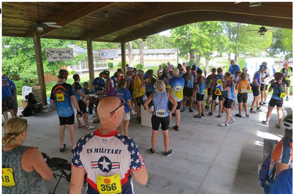
The crowd at Sunday's Bike MS Rest Station

Monday, November 17 CLSPS Dinner Meeting The Flame Restaurant 5 PM – Social Hour 6 PM – Dinner 7 PM – Meeting