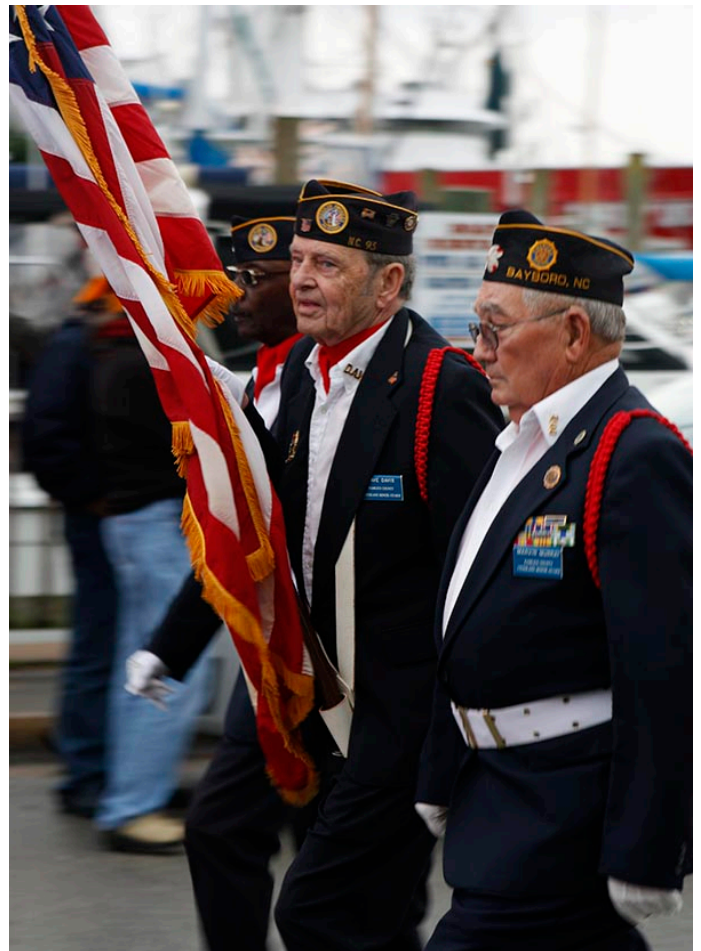
Oriental Christmas Parade

I look forward to taking on the challenge of being your Commander in the upcoming year as I take this new opportunity not only to serve you but to learn more about the operation of the Power Squadron. I urge you to seriously consider joining me on the Bridge to serve your squadron and help your squadron grow and have another successful year which we cannot do without your participation.