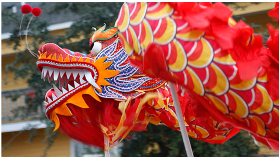
Oriental Christmas Parade