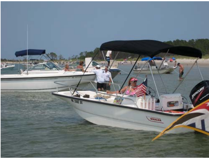
Shallow Water Cruise