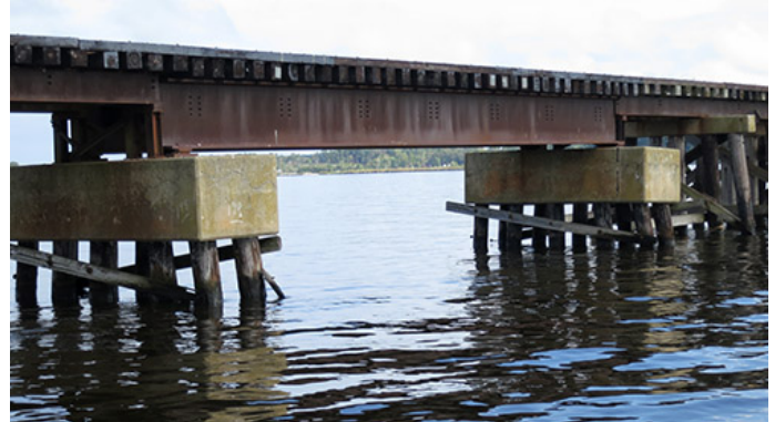
Opening in the New Bern Neuse River train bridge.