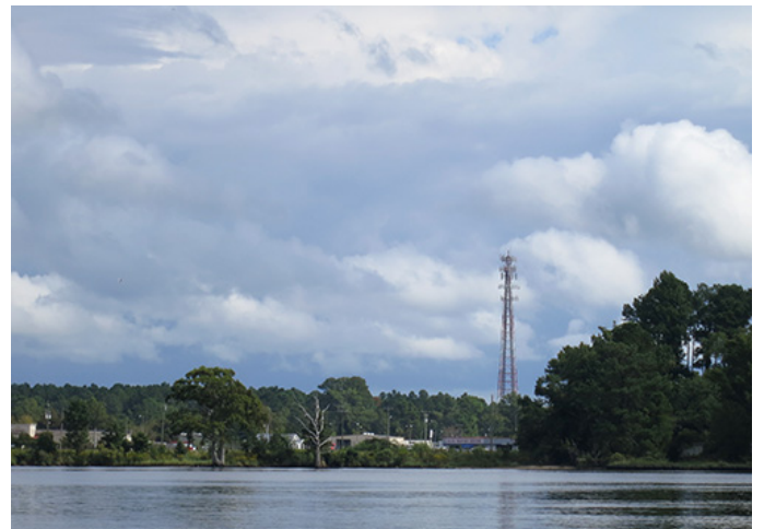
The Chart shows a tower near the water (missing), but not this cell tower