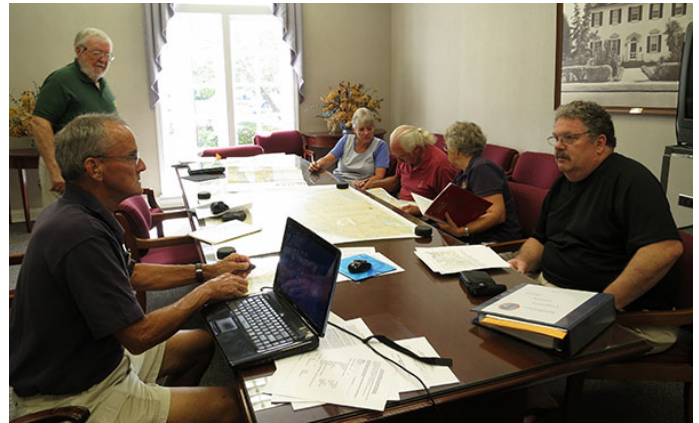
Coop Charting Workshop on Friday