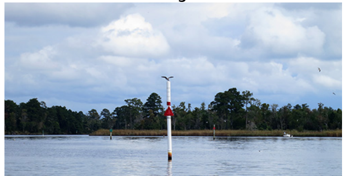
Entrance to Duck Creek