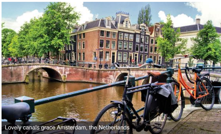
Lovely canals grace Amsterdam, the Netherlands