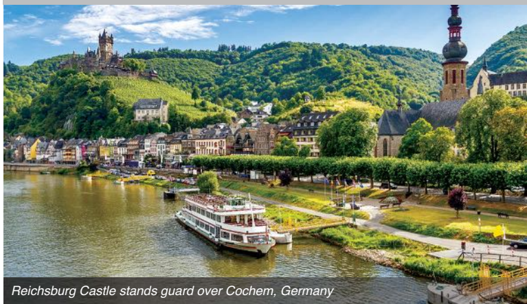
Reichsburg Castle stands guard over Cochem, Germany